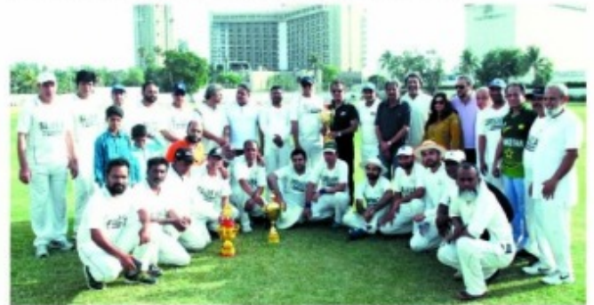
Cricket Match Commissioners XI versus Media XI won by CXI