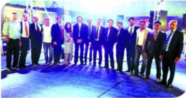
Teamwork to bring the KG Valentines Ball a new look

Karachi Gymkhana www.kg.com.pk kgc@cyber.net.pk