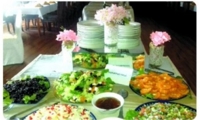
Salad bar is revitalized care of convener Asim Rizwani