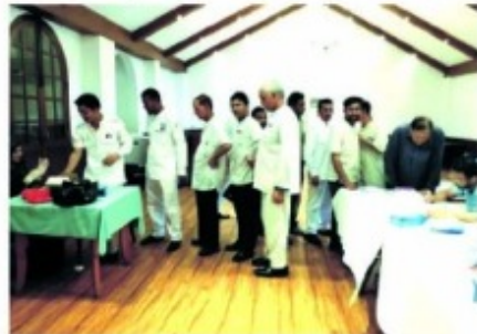
Staff testing for HIV, TB, Hepatitis