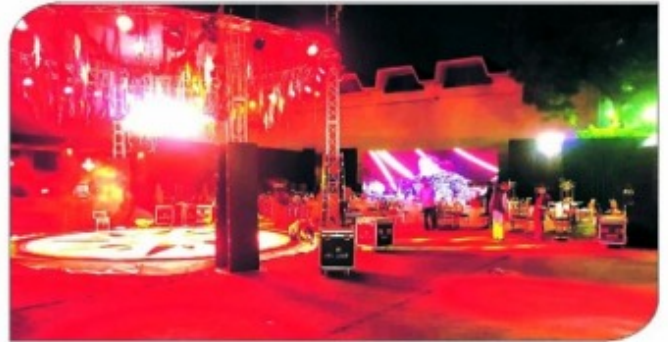
KG Valentines Ball 2019, an unforgettable event !