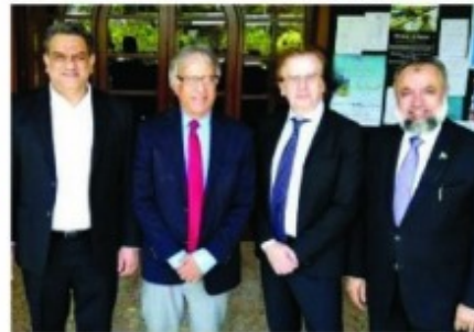
French Consul General Visits KG