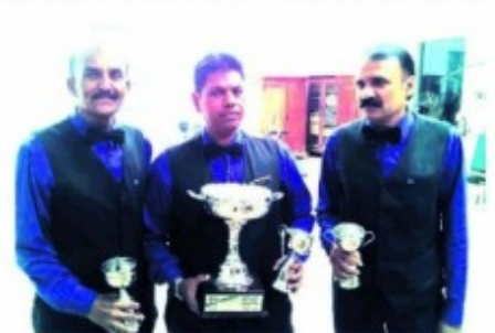
KG Winners of Marker tournament