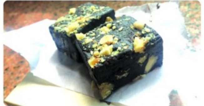
Murtaza Moosa introduces walnut fudge, cakes and biscottis at KG Bakery