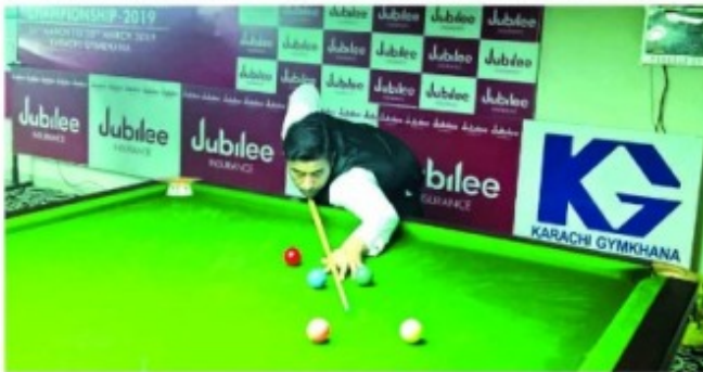
Pakistan Open Snooker Tournament at KG