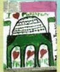
Tile painting event Theme: Pakistan