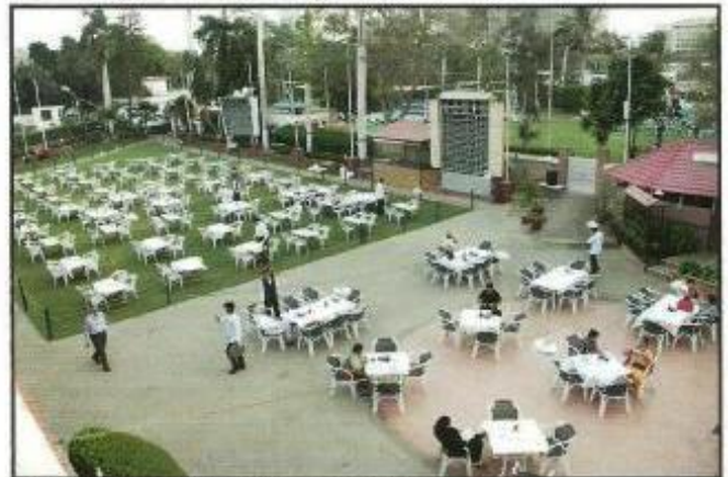
Evening Preparations in KG Lawn