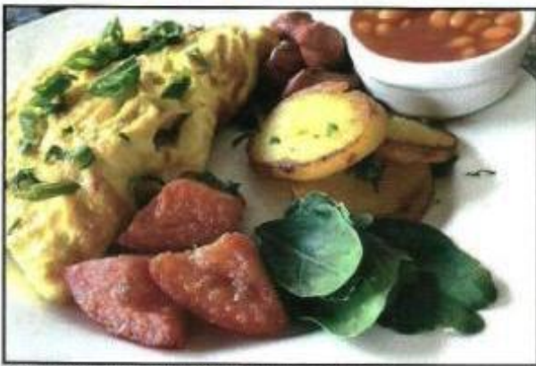
Breakfast platter Rs300 with tea and toast

What is it that is attracting people by the hundreds to KG early morning for a resort style LIVE breakfast? Is it the mediterranean omelette, scrambled eggs or the pancakes to die for? KG has enlisted the services of the famous Shamira (of Cafe Flo fame) to help upgrade its' menu. With over 400 people showing up for breakfast on some weekends, reservation is highly recommended.