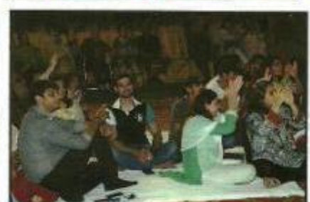
Free entertainment nights every month