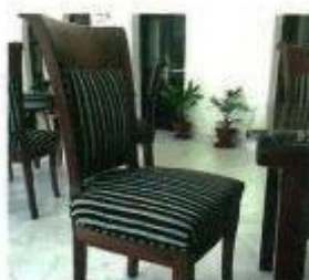
Dining Room Chairs