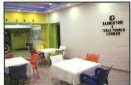
New Badminton and Table Tennis Lounge