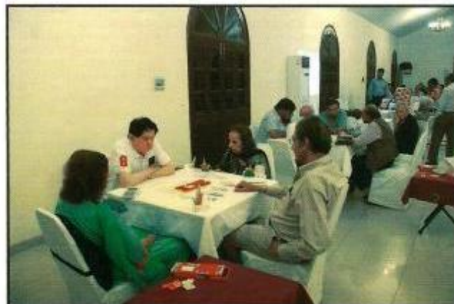
Summer Bridge Tournament