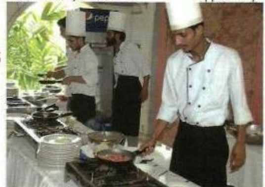
Live Breakfast everyday