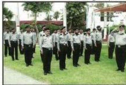
Independence Day program at KG