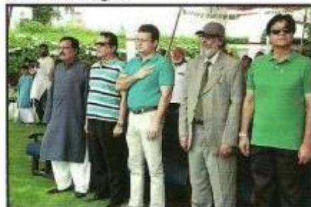
MC Members at National Anthem