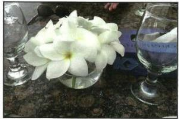
Daily breakfast 8am to 11am, weekends till 12pm

What is it that is attracting people by the hundreds to KG early morning for a resort style LIVE breakfast? Is it the mediterranean omelette, scrambled eggs or the pancakes to die for? KG has enlisted the services of the famous Shamira (of Cafe Flo fame) to help upgrade its' menu. With over 400 people showing up for breakfast on some weekends, reservation is highly recommended.