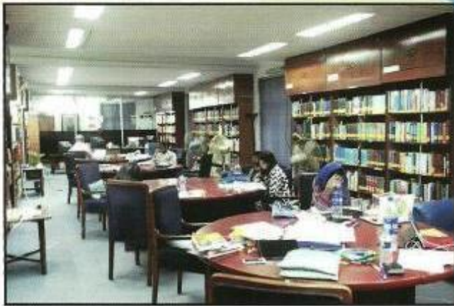
KG Library, a sanctuary for great minds