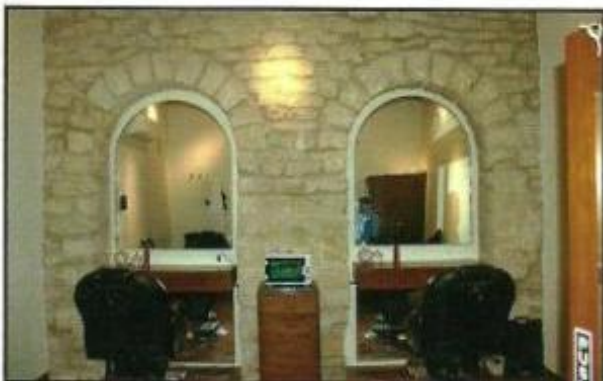
The newly renovated mens barber shop at KG

When they started chipping the wall plaster of the men's barber shop, the renovation team were amazed to find a stone wall behind it. This stone wall has now been exposed which gives a beautiful old look to the renovated barber's shop. Attempts are being made to restore the OLD LOOK OF THE CLUB wherever possible. For this, renovation of certain areas is in progress.