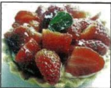
Strawberries & Cream Delight