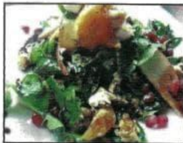
Arugula Salad with Seasonal Fruits, Caramelized Walnuts and Feta