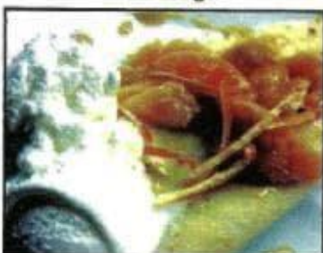
Crepe Suzette with Vanilla Ice Cream