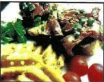
Roast Beef Sandwich with Wasabi Oyster Sauce