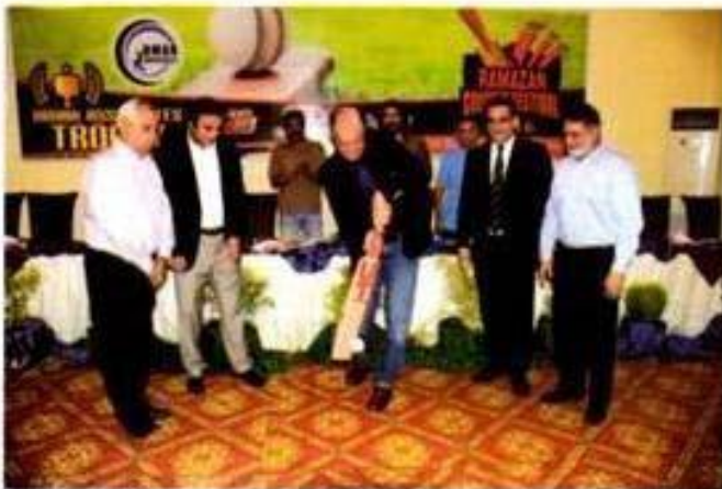
Launch of Ramazan Cricket Tournament