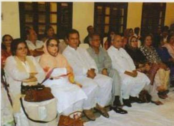
Members enjoying programme "Aaj aur Kal"