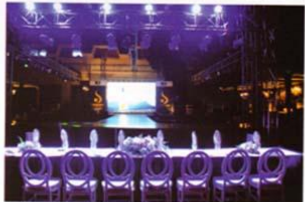
Stage at a glance at the KG May Queen Event