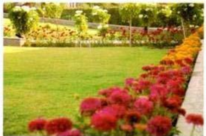
Garden in full bloom