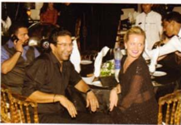
Wasim Akram and his wife at the KG May Queen

Once a very anticipated event at Karachi Gymkhana for couples old and young, the May Queen Event returned with high style this year. The fashion show and ball ran into the wee hours of the morning as the couples enjoyed the night to their favourite tunes. A scrumptious, buffet-style dinner was prepared by KG chefs for this occasion.