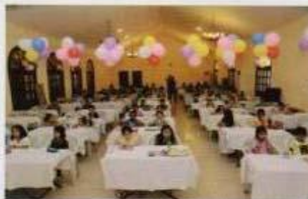
Art Topic was "My favourite place in KG"