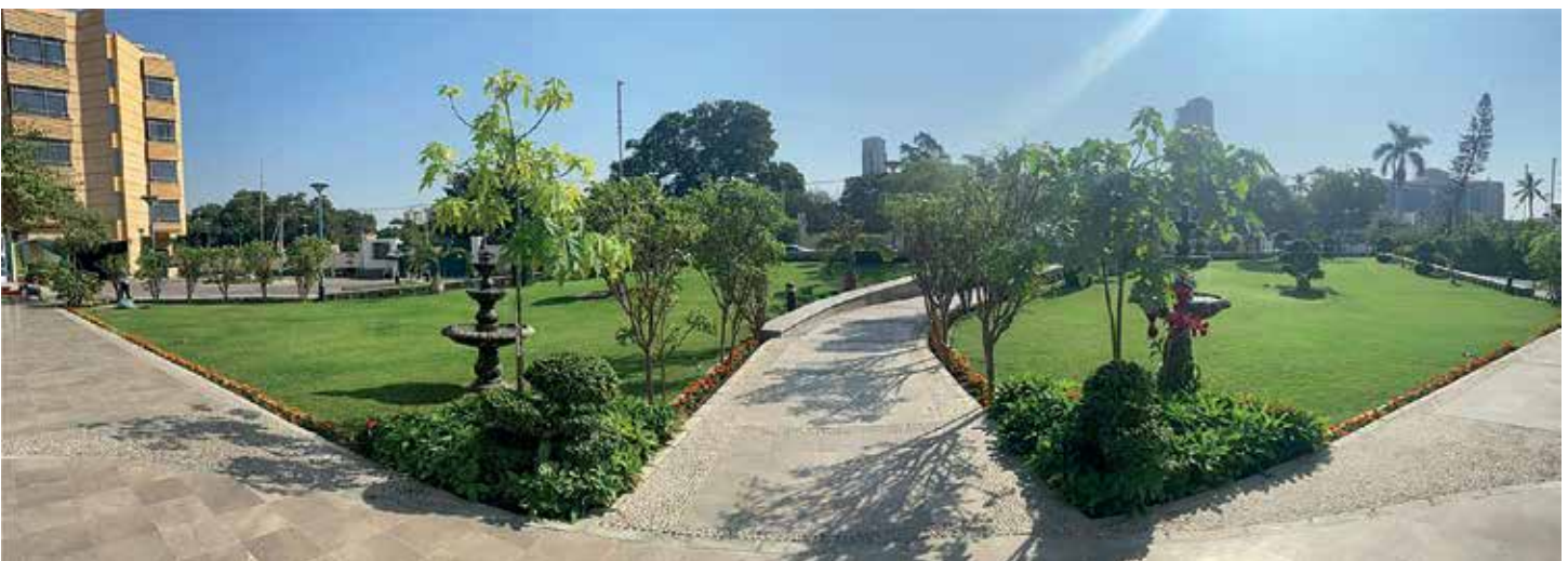
Prize winning KG lawns