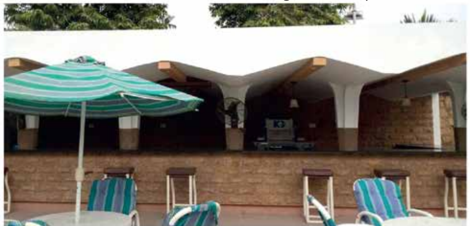
Pool snack bar structure restored