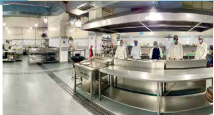
State of the art kitchen standards implemented

Work on many of these projects have been held up due to closures during Covid-19 lockdown and the unnecessary court cases/complaints, initiated by some mischievous members