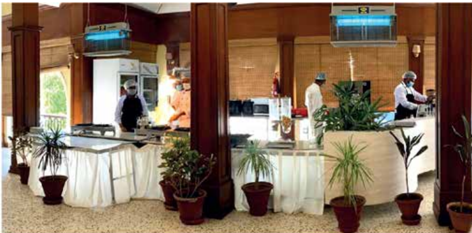
Covid protocols in place at the club dining area