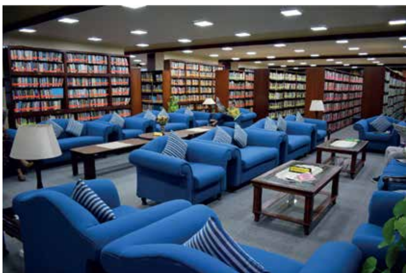
New look of KG library

Do try our caramel Macchiato Mocha Frappe and our Vanilla Lattes. The KG Special 'Dalgona' Coffee is also amazing! With advent of winter, the new Hot Chocolate could be your best friend. Keep dining often so that you can keep a tab on our constantly improving new Menus.