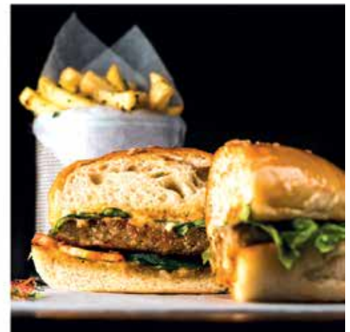
Beef burger new recipe