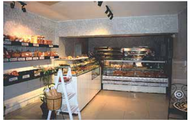
New KG Bakery

So why wait? Visit the Bakery, enjoy the scrumptious goodies and give us your valuable feedback.