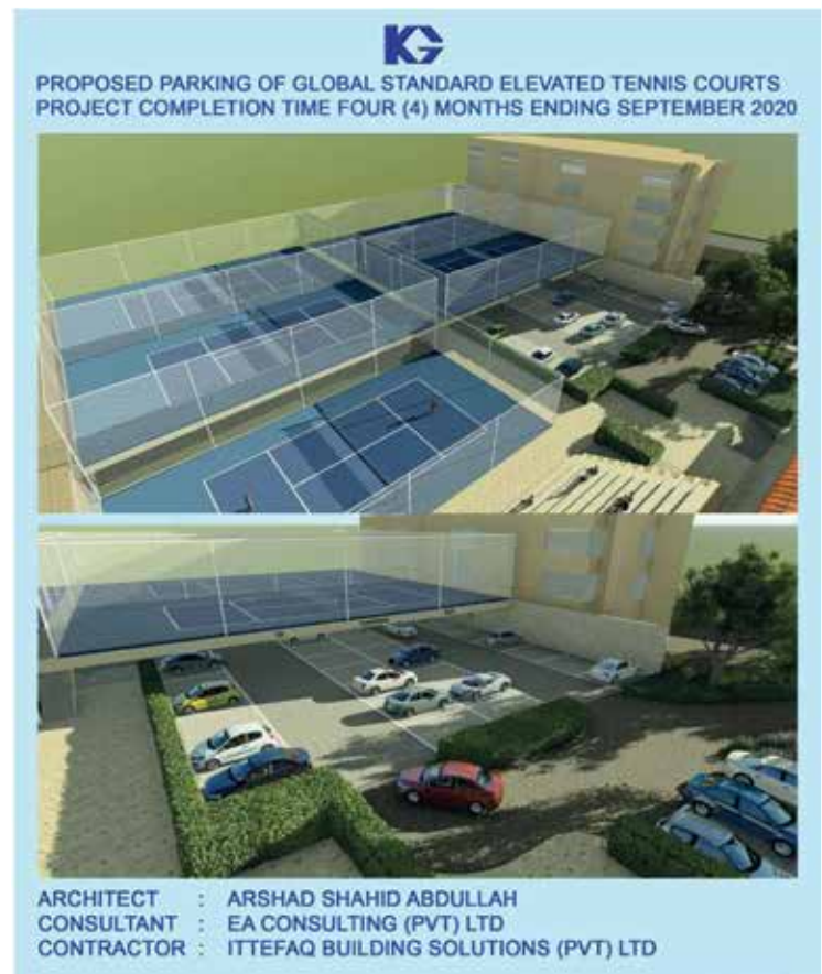
Proposed Car Park

Efforts are being made to resolve these challenges as soon as possible, enabling these projects to re-start, which will not only enhance the facilities for the Members but also improve on the Club's ambiance. We request all Members to continue supporting these initiatives, despite the vocal unruly opposition of the few detractors, who have created hurdles for the Club at each step over the last few years.