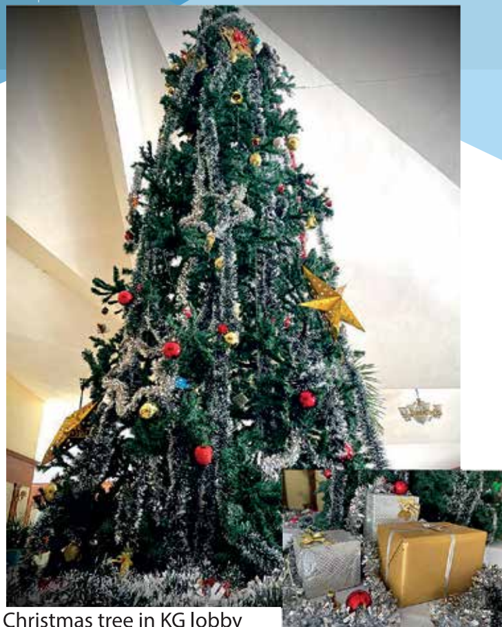
Christmas tree in KG lobby