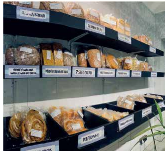
Endless choices for healthy breads