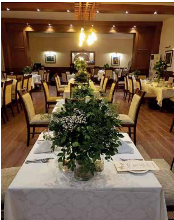
KG Dining hall