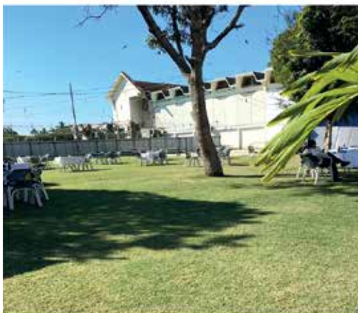
Socially distanced seating