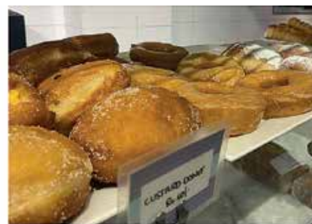
Catering department taken to new levels to meet popular demands