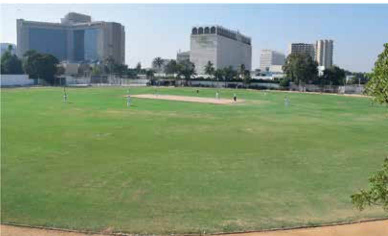
Historical Cricket Ground of KG