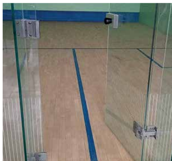
Squash Court floor polished